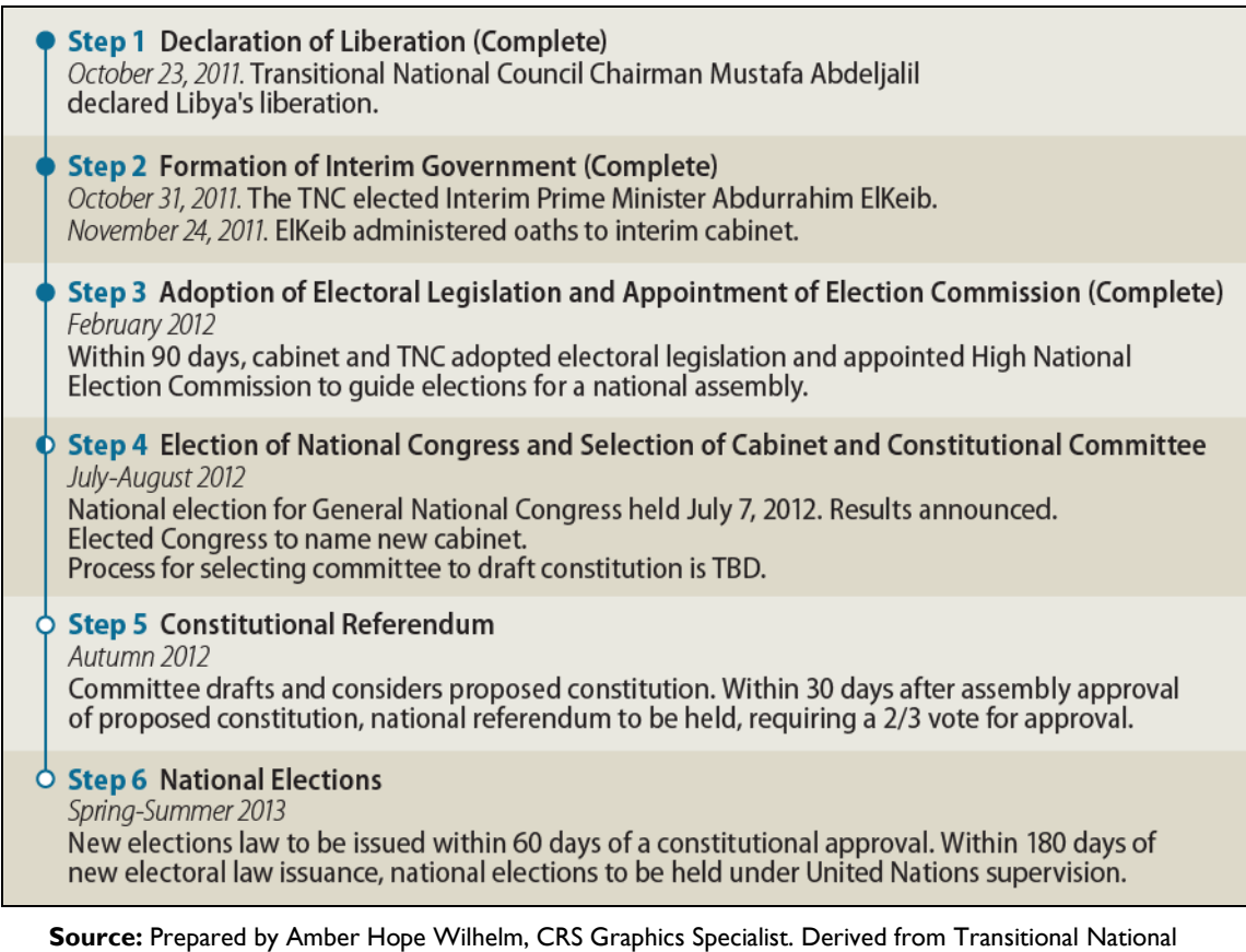
Figure 3. Libya's Proposed Transition Timeline