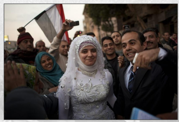
UNITY OF RELIGIOUS GROUPS:

Powerful picture of Christians protecting with the "human chain" Muslims while they prey, and, only day after thousands of Muslims cheering Coptic wedding on Tahrir Square