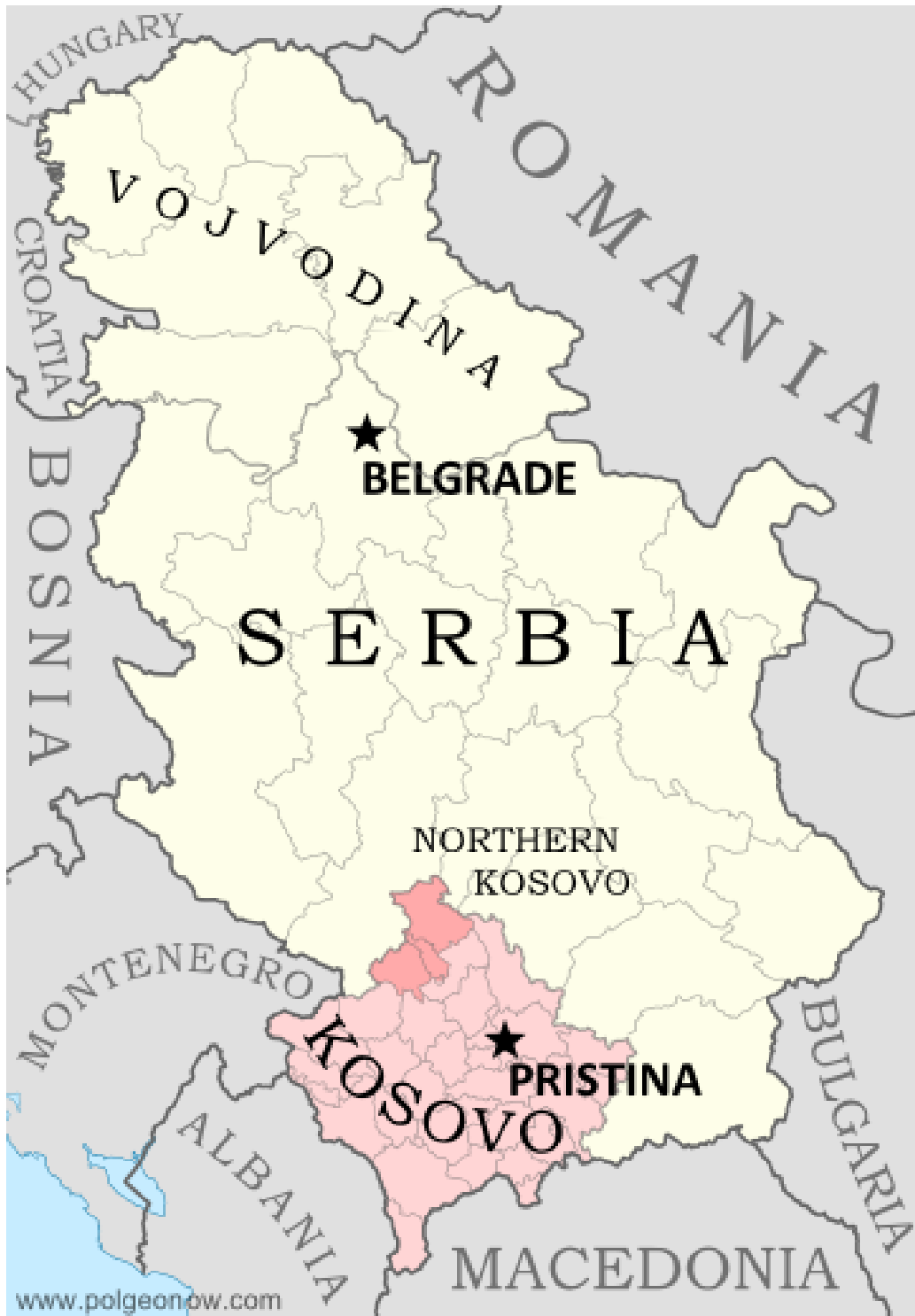
Map by Evan Centanni, based on these two blank maps by Nord-NordWest . License: CC BY-SA